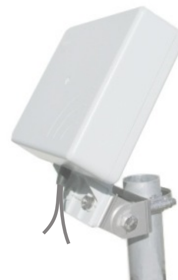
Optional tilting bracket Mast: 35-50 mm with clamp included Wall: with mounting screws (not included)